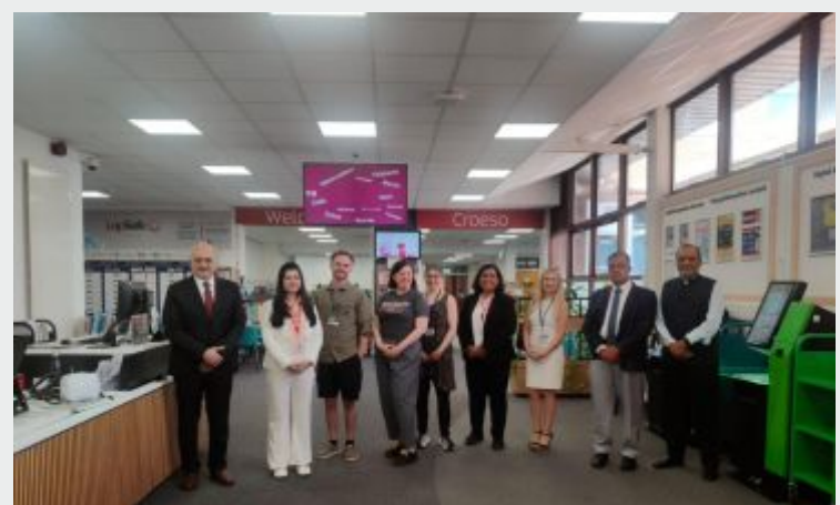
AKI Global Strengthening global ties with Cardiff School of Management